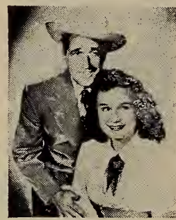
DOT & SMOKEY